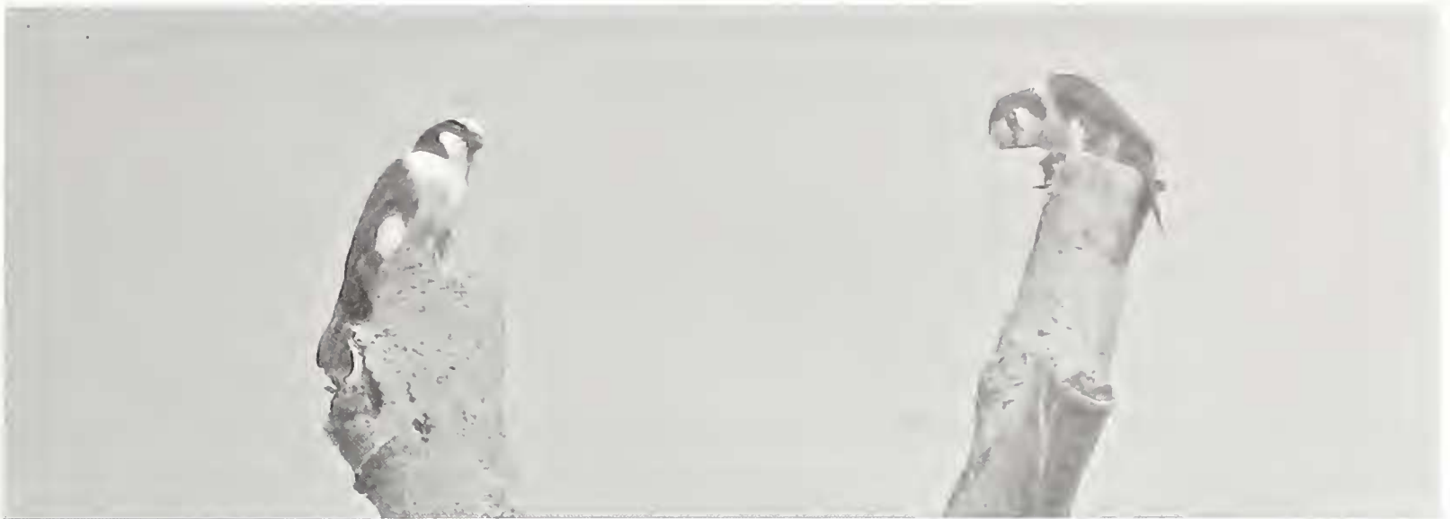
Plate 1. Two male White-fronted Falconets Microhierax latifrons , 1 June 2011, Nunukan, East Kalimantan.

1). Several hunting manoeuvres were observed in which insects were caught in the air with a loop flight and consumed in c.2 minutes after returning to the initial posts.